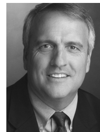
Governor Bill Ritter

Governor Ritter's 8% rating is the same as last year. We had hoped for improvement. No more masquerading as a moderate, pro-business advocate. The mask is off and the real Bill Ritter is disclosed. Make it up to the unions he did with his stealth Executive Order paving the way for unionization of State workers. Remember that "Colorado Promise"? When the District Court ruled against his illegal property tax increase, his arrogance and outright disdain for the lower court decision reveals his confidence that the Colorado Supreme Court will ignore the Constitution. No need to be concerned about the $118 million illegal taxes already collected and spent. Ritter governs by fiat which is bad for Colorado and devastating for taxpayers.